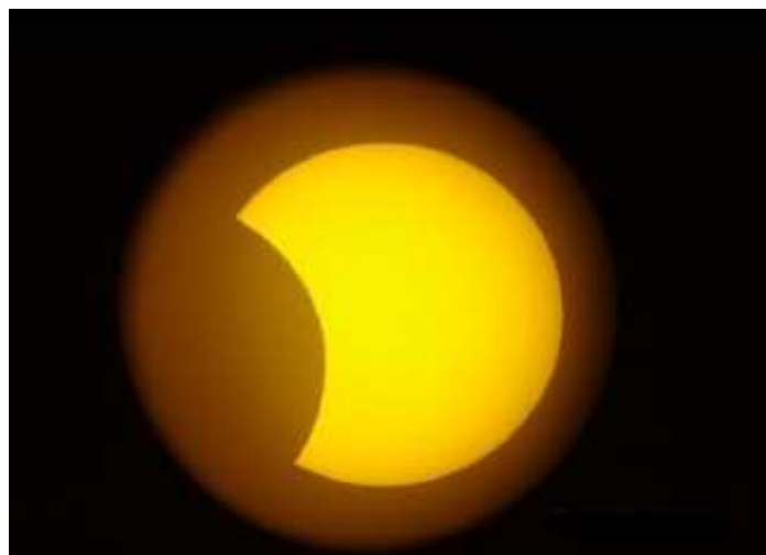
NIK'AJ K'UTUNIK CHIK

Are kuk'ex rib' le q'ij ruk' le qati't, kuya' yab'il chqech chech le qab'oq'och we kujka'y chikaj kamoyir le qab'oq'och, rumal le jun k'exow ib' kub'an le ik' ruk' le q'ij, najtir ojer, are taq kya'taj le k'exoj ib' re le q'ij ruk' le ik' je kkib'ij le ojer taq winaq, are ke'qakayej kuya' yab'il chaqech, xuquje' kub'an q'eqmuj xa jutz'it chik kaka'y le qati't, k'o utewal le uk'exb'alil.